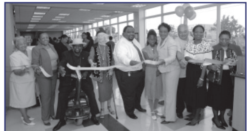
The ribbon-cutting to officially open the Opa-locka Library.