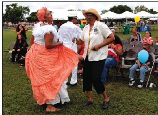
Commissioner Jordan dances up a storm at her 2nd Annual Hispanic Heritage Festival at Acadia Park on September 27, 2008.