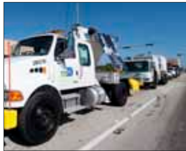
DSWM trucks at the Dr. Martin Luther King, Jr. Day Parade in Liberty City.

On Saturday, January 16th, West Perrine held its annual parade in the morning while Homestead and Florida City joined forces in the afternoon to pay tribute to the late civil rights leader, who would have turned 81 this year. DSWM employees marched and rode in several Department